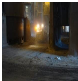
Bobcat at ladle car area