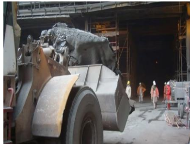
Loader taking out lump skull