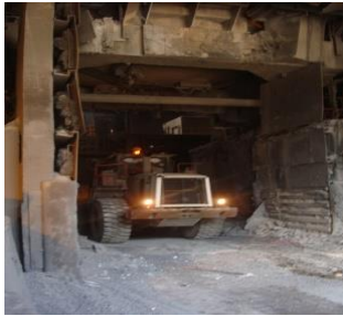
Loader cleaning under EAF