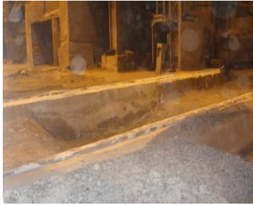
Ladle car rails showing outer pit