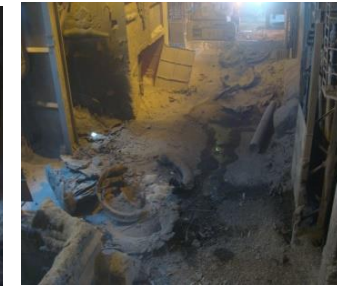
Zero level between Caster & EAF